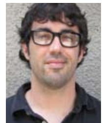
Sevell Sevell + Sevell, Inc.

"For a relatively small contribution there is an entire staff of talented individuals who bring publicity & opportunity to the neighborhood"